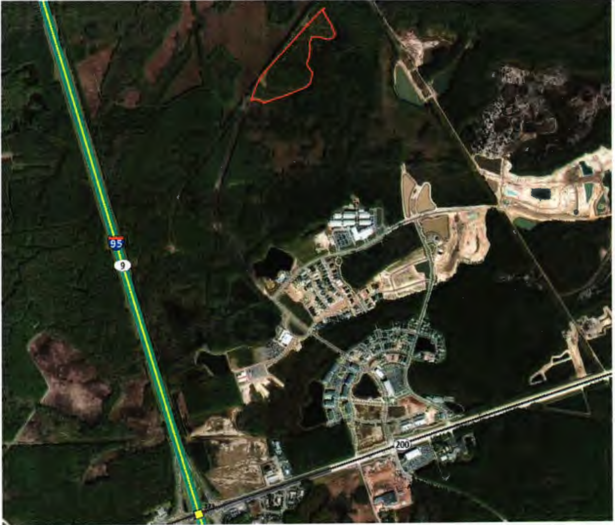
Exhibit B – Location Map